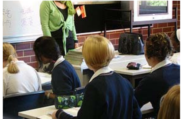
Literacy and numeracy among Australian school children has not improved since the 1960s, a new study says. (File photo)

Tags: education , schools , primary-schools , australia , act , canberra-2600